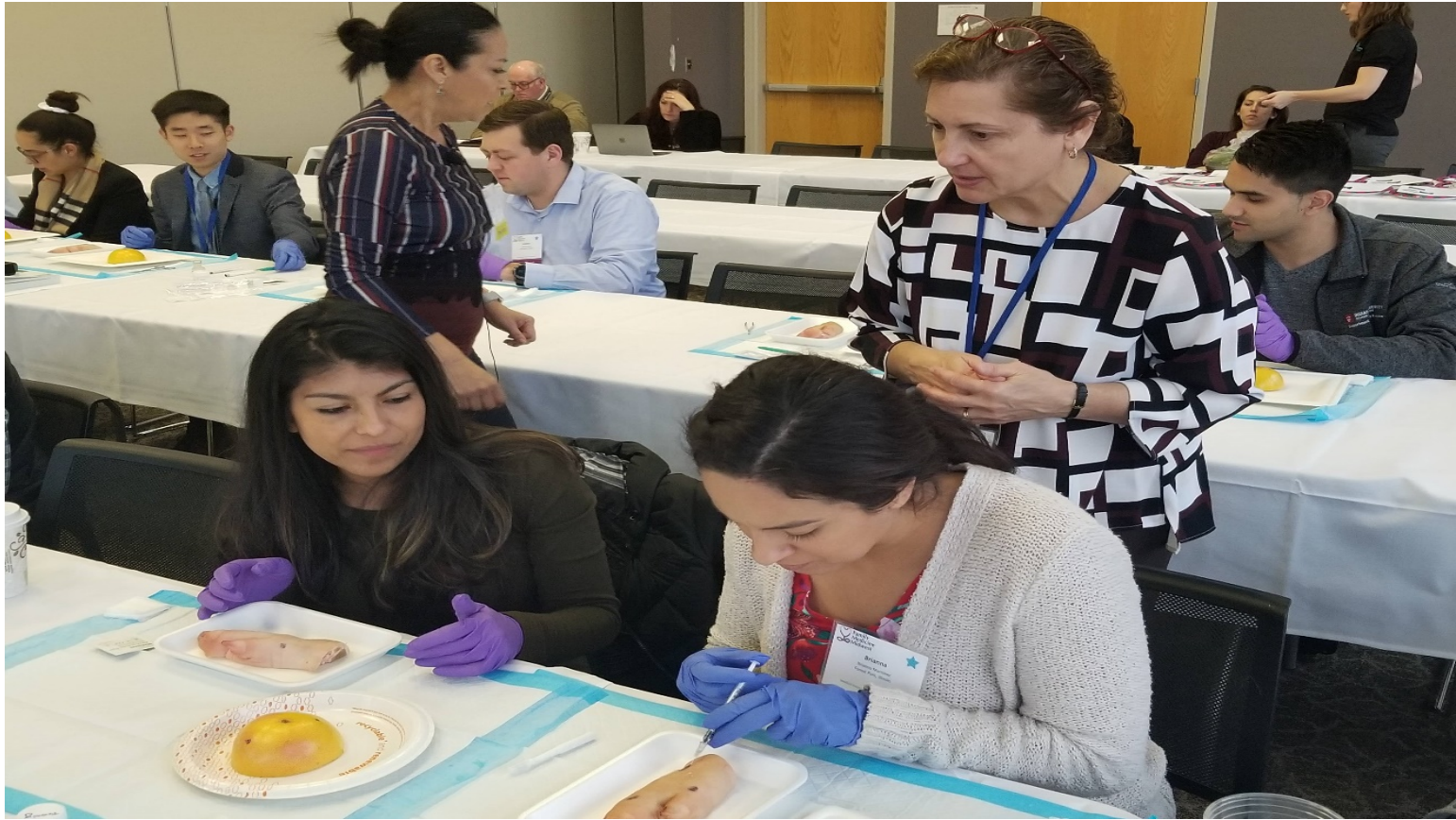
Hands On Workshops